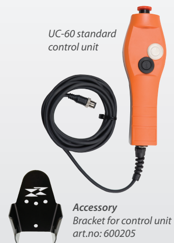
Accessory Bracket for control unit art.no: 600205