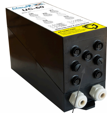
Standard model (5xM12)